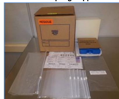
Figure 2: Residue Sampling Supplies