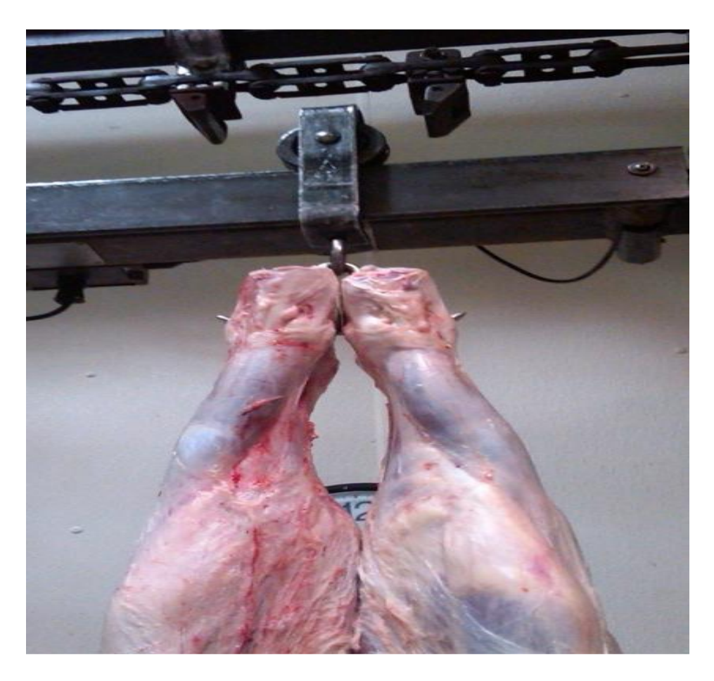
Figure 1 . Example of a veal carcass with both hind limbs suspended from a single hook. This practice prevented the antimicrobial treatment from achieving full carcass coverage, a critical operating parameter.