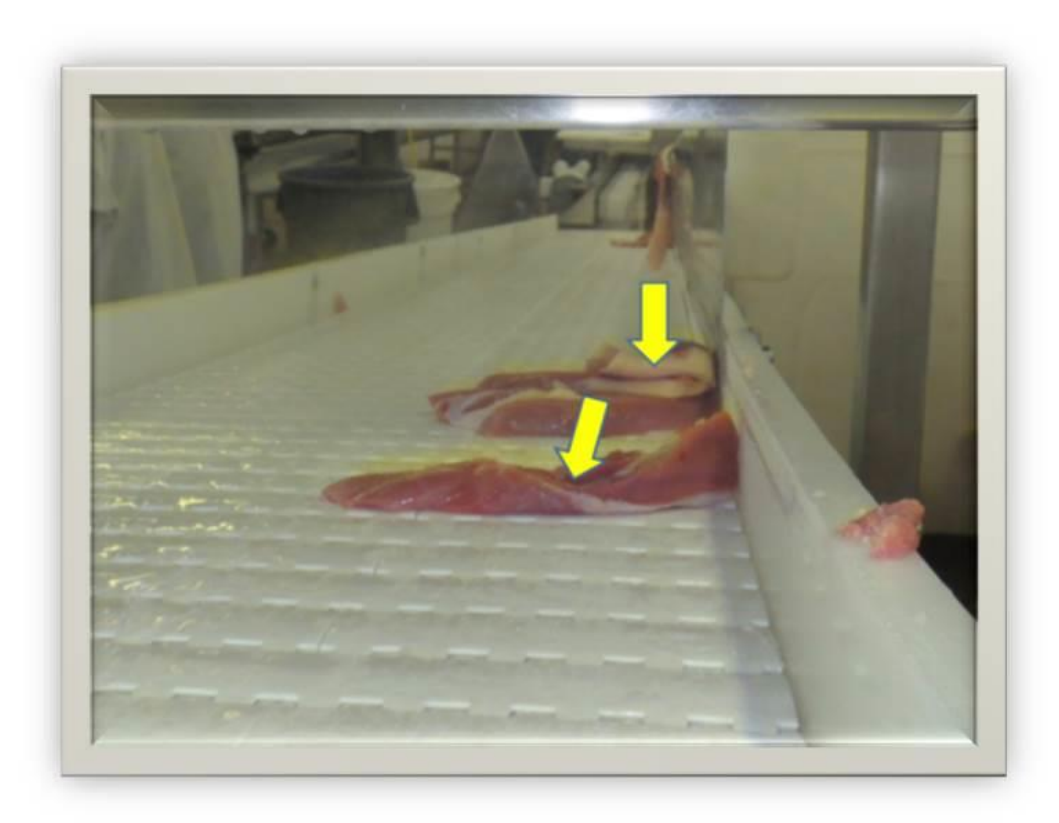
Figure 2. Product is folded as the antimicrobial treatment is applied, which prevents the antimicrobial treatment from achieving full product coverage, a critical operating parameter.