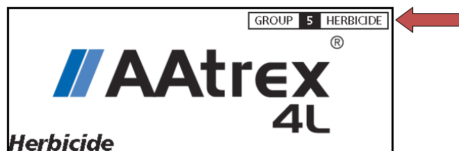
Resistance group indicated on front panel of pesticide label.

Several pesticide industry and academic groups have developed classification systems that group insecticide, herbicide, and fungicide active ingredients by mode of action. Active ingredients that work by the same mode of action are assigned the same group number. The EPA has requested that pesticide manufacturers include the group number on the front panel of pesticide labels in the format shown below.