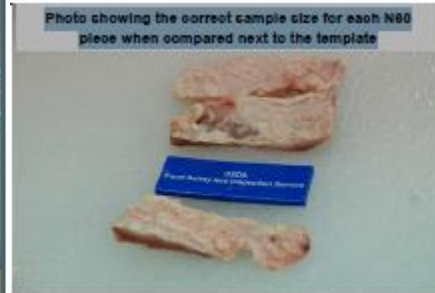
Photo showing the correct sample size for each N60 piece when compared next to the template

13. In the third sterile Whirl-Pak® bag, aseptically collect samples of trimmings from the same production lot by using a grab sample technique. It is not necessary to count the number of pieces or to cut the pieces to a certain dimension. Collect pieces with as much external surface as possible.