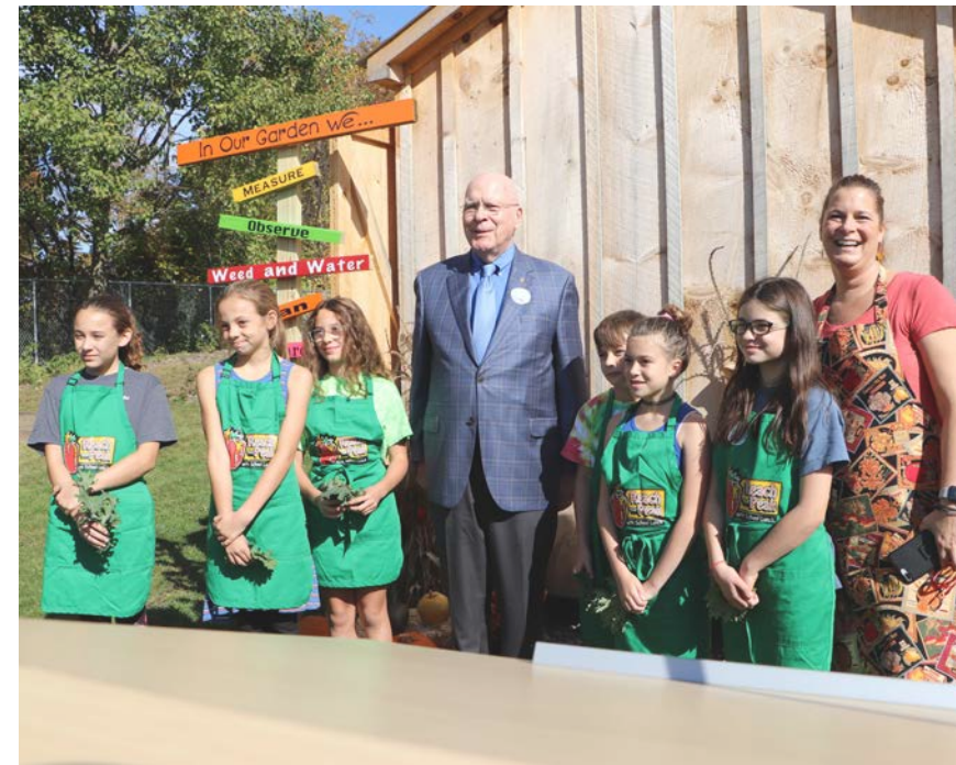
Senator Leahy visits St. Albans Town Education Center, a 2019 program grantee.