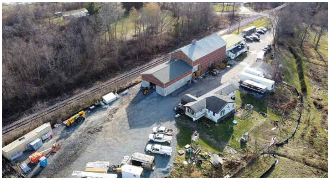
Aerial view of expansion of VLSP facility in Ferrisburgh

"The Working Lands grant is directly supporting our business by helping us upgrade our facility to have more efficient, sustainable, and reliable equipment," Cushing said. "The equipment we have selected for our facility will not only improve the work environment but will also allow us to provide more value-added product options to the producers we work with. We will be able to produce value-added products that are neatly packaged and labeled