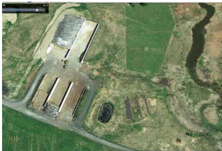
Satellite picture of the Woodnotch Farm feed bunk facility before the EQIP & BMP project.

The old vegetated treatment system for silage leachate was causing the storm runoff to overload a small Vegetated Treatment Area with nutrients. Additionally, since the low flow tank did not have an automatic pump system, “the farm would have to go down there with a tractor and pump out the tank every so often. Which wasn’t a very feasible option,” said Jason Bradley, the State of Vermont BMP Engineer that helped the farm with the project. If the low flow tank overflowed, it had the