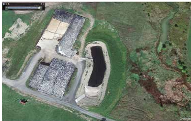
A satellite view of The Woodnotch Farm feed bunk facility after the EQIP & BMP project.

potential to flow into a small stream below the feed bunk, and from there into Lake Champlain.