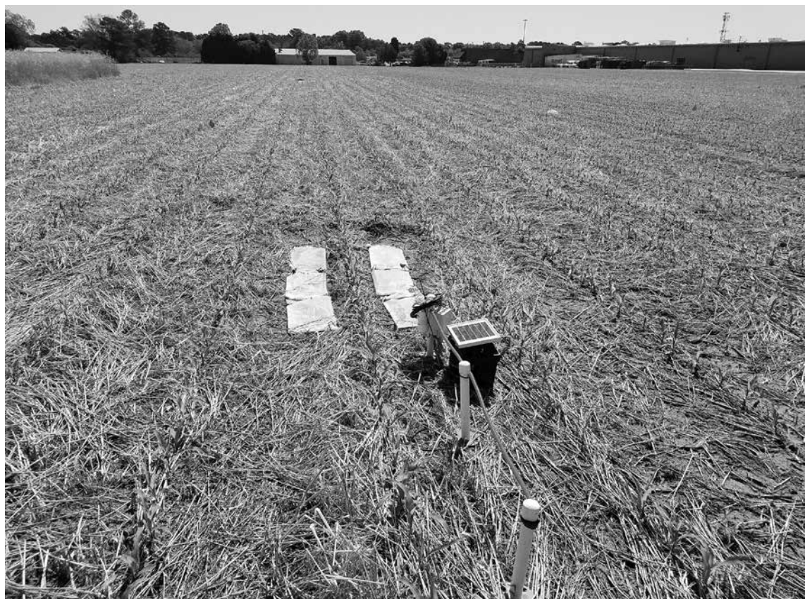
Image 2: Decomposition bags measure the rate of cover crop decomposition while solar-powered sensors measure soil and water parameters.

After the corn crop has emerged, water and temperature sensors are installed in cover cropped and bare strips. The sensors are installed at five different depths: 30", 15", 4", 2" and on the surface. Each strand of sensors is connected to a node. The four nodes 'talk' to a gateway which transmits the data to the cloud and onto an online dashboard where researchers and farmers can view the data. Soil moisture and