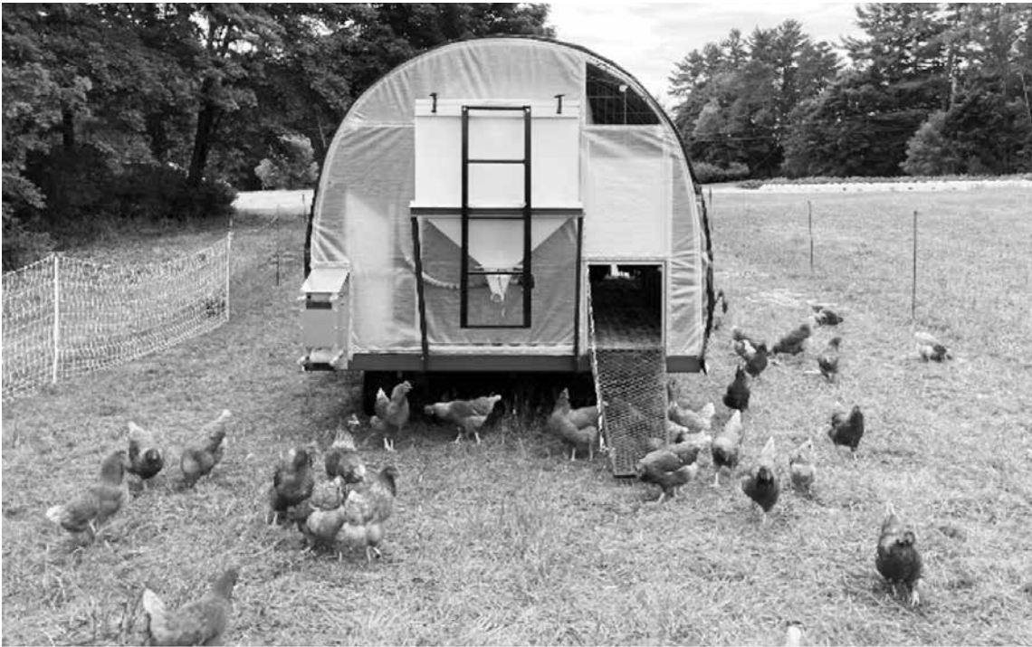
Hens enjoying a new mobile chicken house at Shelburne Farms. Most egg operations in Vermont have fewer than 50 laying hens (source: Vermont Agriculture and Food System Strategic Plan: 2021-2030).