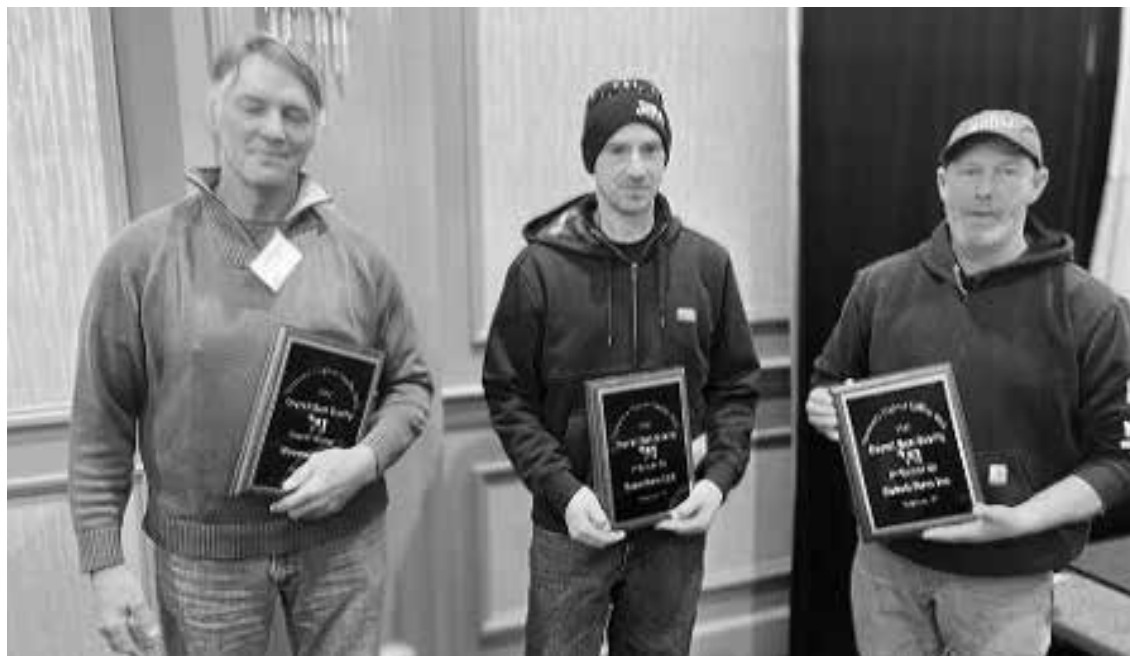
Award winners left to right, Howmar Farm (Winner), first runner up Essex Farm and second runner up Dubois Farm.