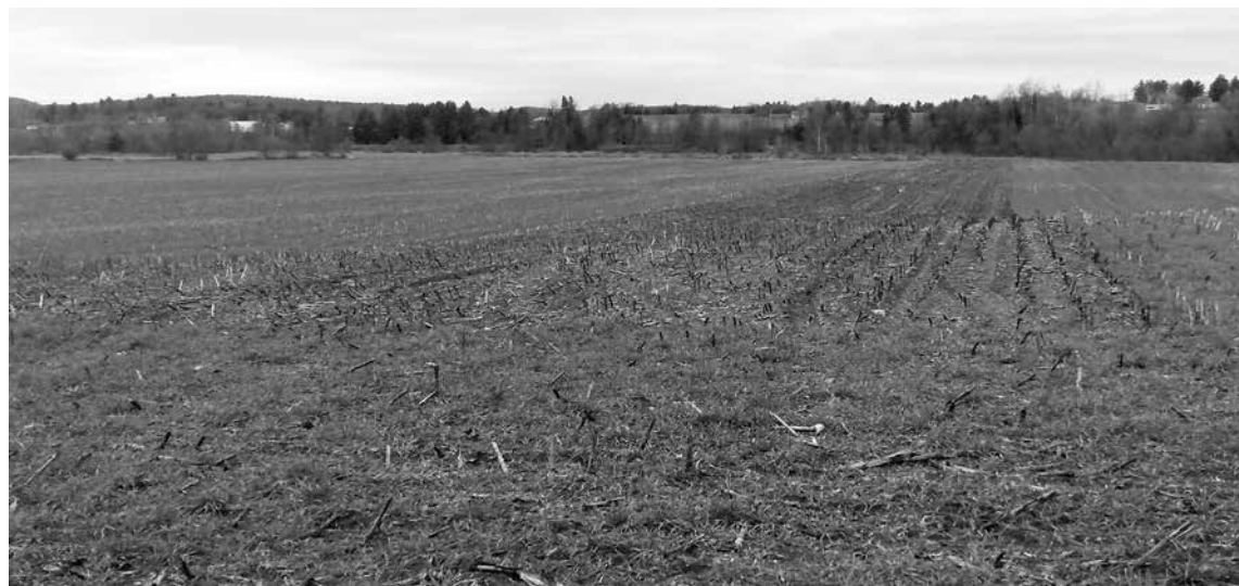
Image 1: Participating farmers leave bare test strips in their cover cropped fields to help evaluate the effects that cover crops have on soil and crop yield.

This work is supported by the Agriculture and Food Research Initiative's Sustainable Agricultural Systems Coordinated Agricultural Projects [award no. 2019-68012-29818] from the United States Department of Agriculture (USDA) National Institute of Food and Agriculture.