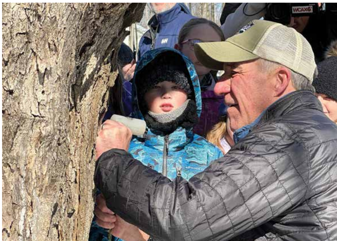
Governor Phil Scott tapping a tree.

making maple the second largest agricultural crop in Vermont behind milk and highlighting the importance of this industry to our state."