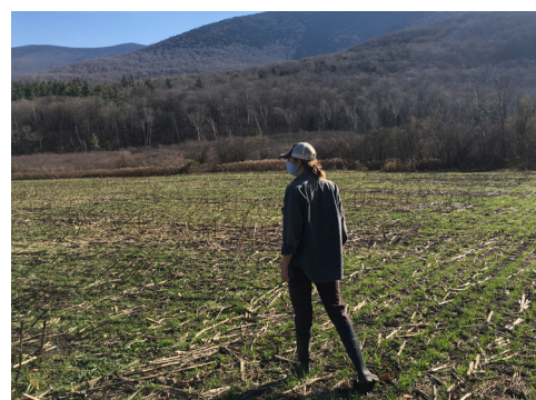
AAFM Eco Americorp Service Member assesses cover crop