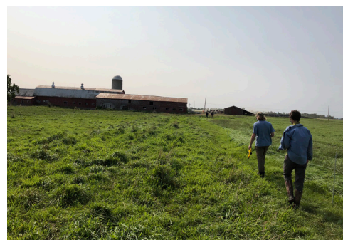
AAFM Water Quality Specialist and DEC Environmental Analyst assess a pasture