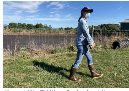
Above: A VAAFM Water Quality Specialist assesses areas adjacent to a manure pit during an inspection.

Below: A VAAFM Water Quality Specialist measures the distance between an annual crop field and the adjacent surface water.