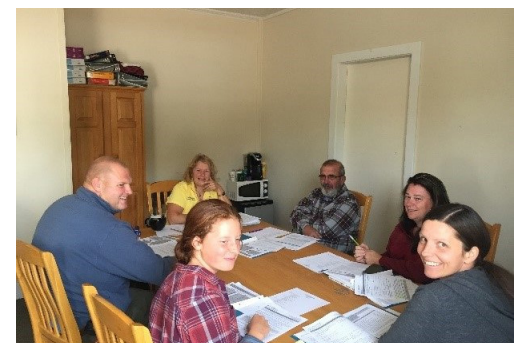
Poultney-Mettowee Natural Resources Conservation District assists farmers at an Agricultural Grant Writing Clinic in developing and submitting applications for funding water quality projects.