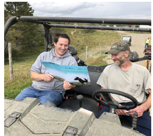
Vermont Association of Conservation Districts (VACD) technical assistance staff review a conservation plan with a farm in the Missisquoi River watershed while planning projects under the AAFMM Pasture and Surface Water Fencing Program.